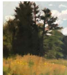
Sandy Haynes Fields of Goldenrod