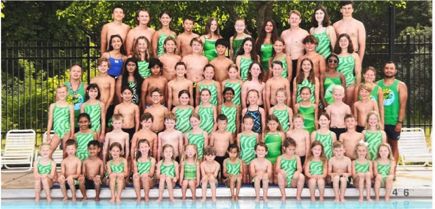
2023 Crocs Swim Team

The Chesterfield Family Aquatic Center had a very successful July. We only had four rain days where we closed. Staff continue working very hard to assure safety of all patrons.